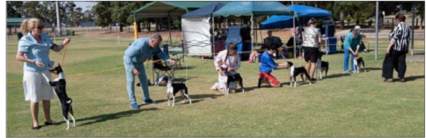
Judging best tri colour coats