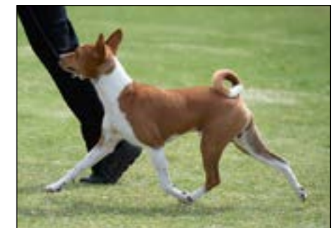
Photos taken during competitions at the Basenji Club of Victoria Championship Show on 4 March 2023