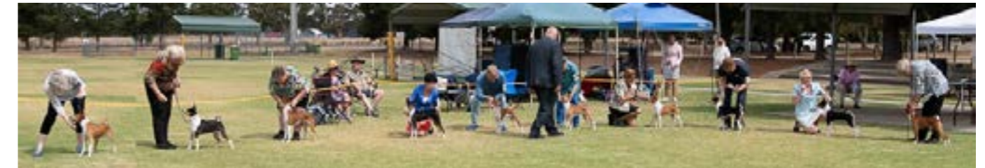
Line up for Dog Challenge competition