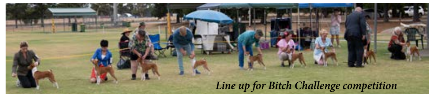
Line up for Bitch Challenge competition