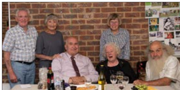
Right: Annual oldest in attendance photo.